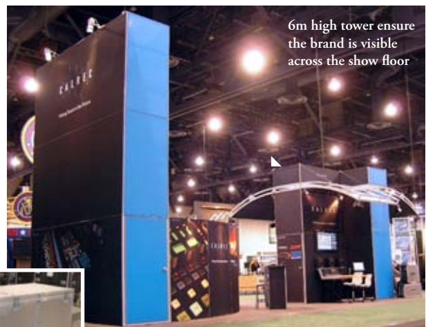
6m high tower ensure the brand is visible across the show floor