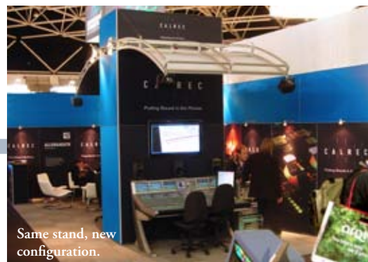
Same stand, new configuration.