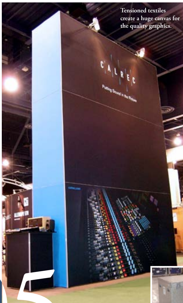
Tensioned textiles create a huge canvas for the quality graphics.

Working with Bell Stone’s revolutionary new EZ Modular™ system, the completed stand met all the build requirements and was a resounding success visually.