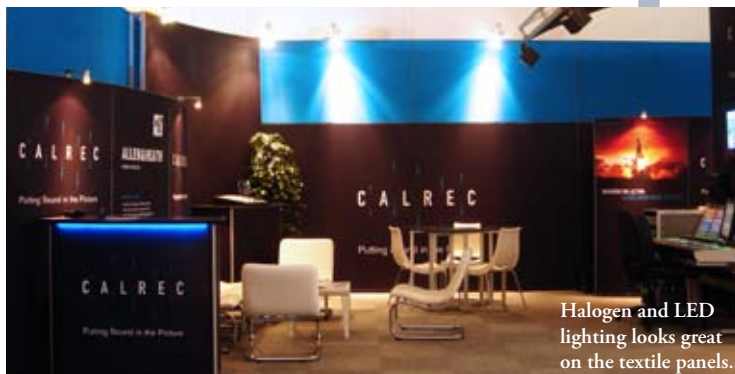
Halogen and LED lighting looks great on the textile panels.

With those kind of results no wonder the client’s reaction was a simple “Wow!”